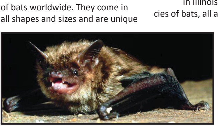
Year-round Illinois resident, the Big Brown Bat

There are over 1,250 species of bats worldwide. They come in all shapes and sizes and are unique