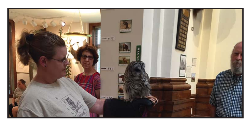
Onlookers see the barred owl up close. This bird of prey is known for its call that sounds like "Who cooks for you? Who cooks for you all?"

This program was staged at the Elgin Public Museum, while Mu-